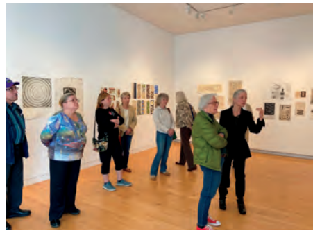
Trip to Aldrich Museum