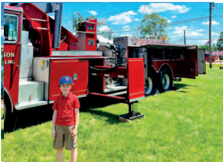
Patterson Rotary Touch A Truck