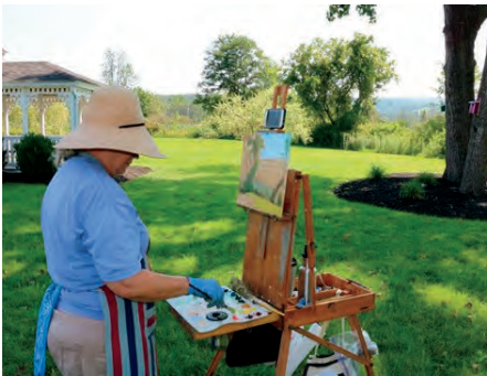
FroGS Plein Air Event