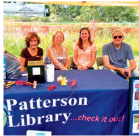
BOT Members at Patterson Rotary Blues & BBQ

I am always impressed by the wonderful work our Director and her staff do at the library. As President of the Board of Trustees, I see firsthand the effort staff put forth to provide our patrons with the outstanding level of service and resources that make us a stronger community. It goes far beyond the programs and events that fill the calendar or our great collection of resources. It is how we work with our local agencies and organizations to help our neighbors. We collect food year-round for the Patterson Food Pantry, coats for Putnam CAP, school supplies for our local children, and toiletries for veterans, to name a few. We host pet adoption events and partner with the Patterson Recreation Department to provide musical entertainment for the Putnam Lake Seniors at their holiday luncheon and offer offsite programs for our Putnam Lake residents. We march in parades, participate in holiday festivities, and attend meetings with town leaders to discuss important topics affecting our community. We support local businesses whenever possible and are grateful for their support in return. This level of commitment makes me so proud of our library and to be a resident of this community.