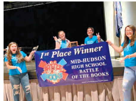
Battle of the Books Team